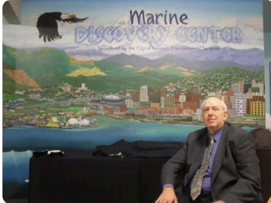
At the Christmas Banquet