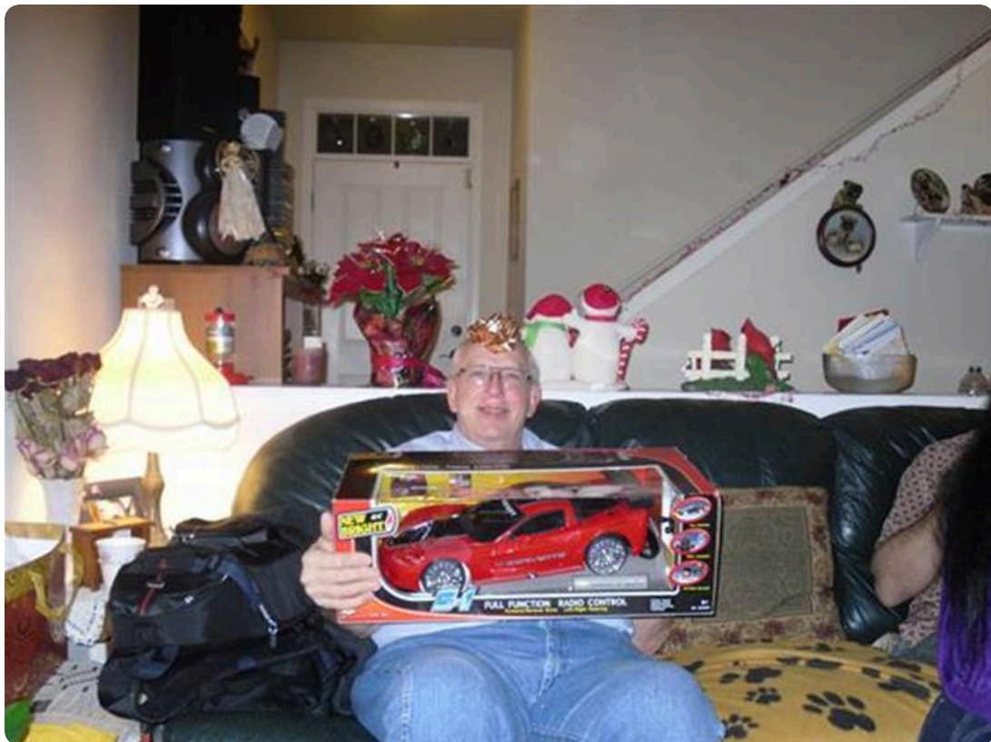
Still a Kid at heart